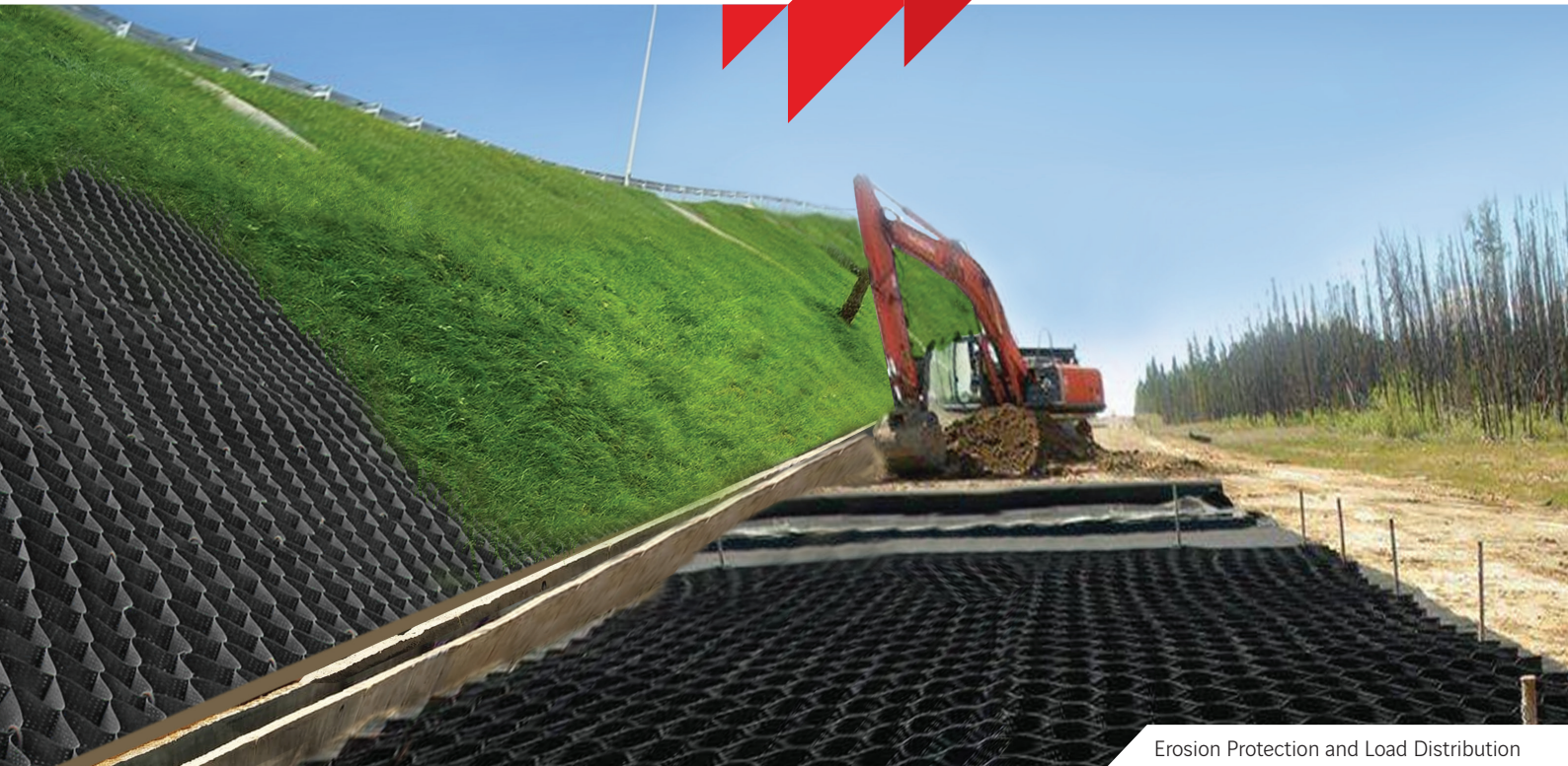
Erosion Protection and Load Distribution